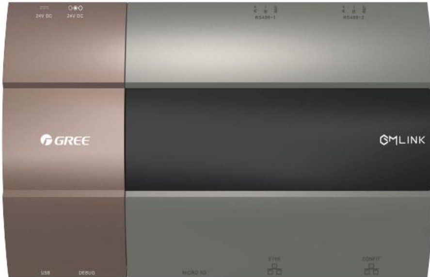
Diagram of Interface Function

C&H protocol gateway ME30-24/D1(BM) for multi VRF unit can realize data exchange between air conditioner and BMS system and provide building interfaces for standard Modbus RTU, Modbus TCP and BACnet/IP. This gateway is applicable to the C&H multi VRF unit that uses CAN protocol.